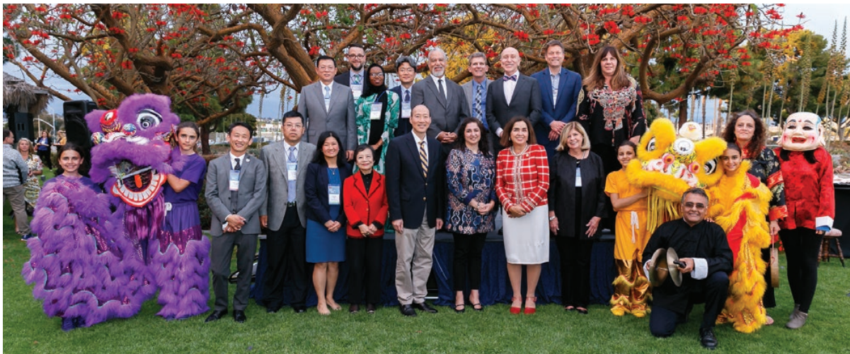
The 12th National Chinese Language Conference in San Diego

Meanwhile, our National Chinese Language Conference continued to thrive as the largest annual professional development meeting of Chinese language teachers in the world outside China, drawing more than 1,300 to this year's conference in San Diego, and thousands more through a new online platform. At a moment when communications between the U.S. and China are so fraught with tension, our Chinese Language Programs Network of 100 exemplary Chinese language programs engages over a third of all Chinese language teachers teaching in the United States today, and through them, 40% of all Chinese language learners in U.S. schools. As Asia Society Vice President Tony Jackson put it, "It's a labor of love. When we engage students to the extent they want to take leadership and make the world a better place — that's what makes our work meaningful."