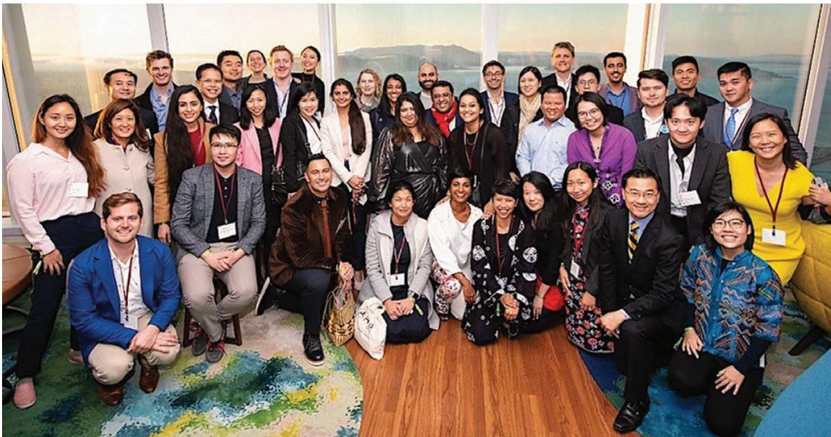
New members of Asia 21 at the 2019 Summit in California.