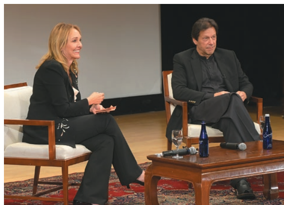
Imran Khan (right) in discussion with Asia Society President and CEO Josette Sheeran.

Each September, global leaders descend on Asia Society New York during the UN General Assembly meetings for a series of well-attended, news making discussions that attract full houses to our building, as well as millions of views on YouTube and other social media. This year Asia Society hosted the Prime Ministers of Thailand and Pakistan; Foreign Ministers of India, Iran and the Philippines; the National Security Adviser of Afghanistan; the U.S. Special Representative for Iran; and the First Lady of Japan.