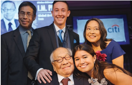
I.M. Pei and family at our 2016 Asia Game Changers Awards.

I.M. Pei died in New York in May, age 102. A giant in architecture, friend of the Asia Society, and 2016 Asia Game Changer. On that occasion, the then-99-year-old Pei accepted his award in person. “I usually have a lot to say, but tonight...I’m grateful. I’m thankful. And I want to thank you all for coming.”