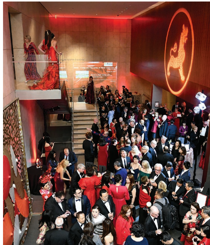
CLOCKWISE FROM TOP LEFT: Premier of Victoria, the Hon. Daniel Andrews MP, officially opens Asia Society Melbourne at the Hawker Ball; guests at the Asia Society Texas Tiger Ball, celebrate our 40 years in Houston; L-FRESH The Lion at the Hawker Ball.